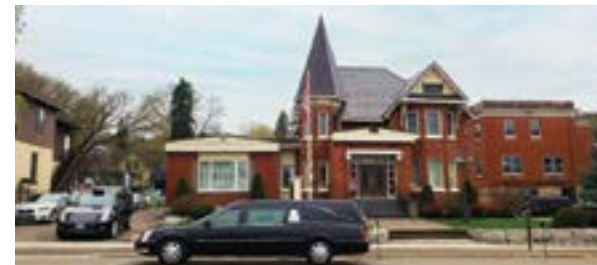
Midland's Only Family Owned Funeral and Cremation Centre

Serving this community since 1878, and proudly family-owned.